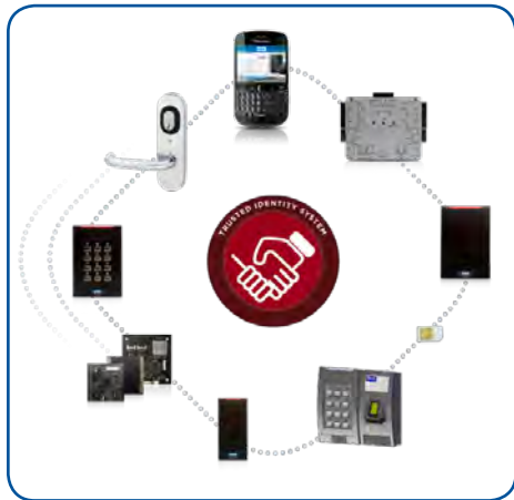
iCLASS SE® Platform