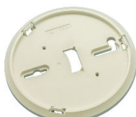
Figure 8: 4098-5227 5 in. adaptor for 4098-5210 sounder base