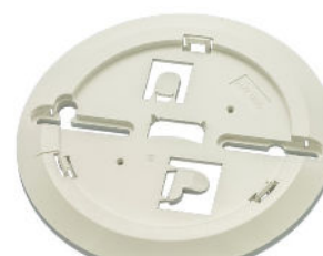
Figure 9: 4098-5228 6 in. adaptor for 4098-5210 sounder base