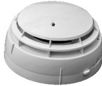
Figure 2: Photo, Photo-Heat, or Photo-Heat-CO detector, on standard 4 in. base