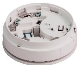
Figure 7: 4098-5210 sounder base, with supplied mounting flange

For applications requiring reduced sound level, you can adjust the output volume at the sounder base using the Volume Trimmer Tool 517.050.015