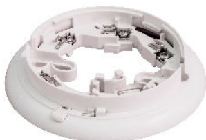
Figure 5: 4098-5207 5 in. base