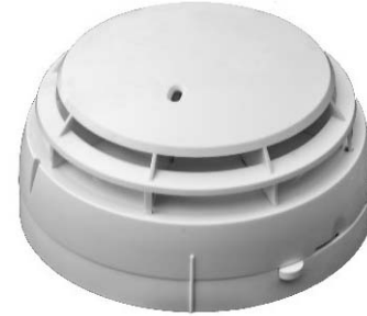
Figure 1: Heat detector, on standard 4 in. base

The sensors communicate to the Foundation Series FACUs using MX Technology communications. Each detector can operate in one of several detection modes to ensure it is easily optimized to the relevant risk.