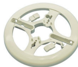
Figure 4: 4098-9799 6 in. adaptor for 5 in. base