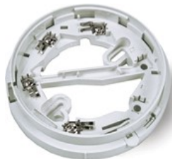
Figure 3: 4098-5261 4 in. base

The 2098-9808 or Remote LED Alarm Indicator, see Figure 6, provides a remote indication that the sensor is in alarm. Refer to Table 7 for dimensions.